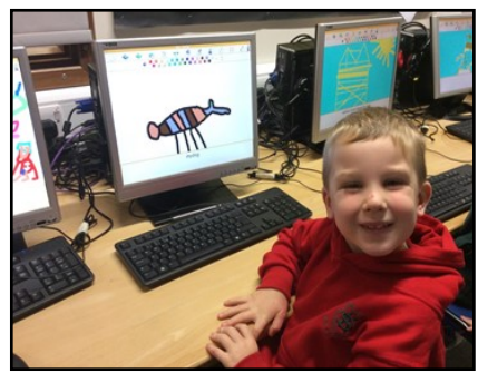
Year I- Gifts and Presents Topic Day

To launch our topic of "Gifts and Presents", we had a Topic Day where the children designed and made a gift for a friend. They really enjoyed thinking about what their friend would like and making something appropriate. We then