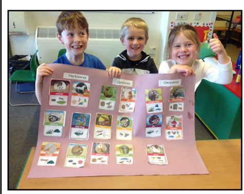
Year I were Animal Scientists this week. They had to look at the animals' diets and sort them according to whether they were carnivore, herbivore or omnivore. This brought up a lot of discussion about what exactly meat is (as it includes insects and bugs). They all did a great job and enjoyed this learning about animals.