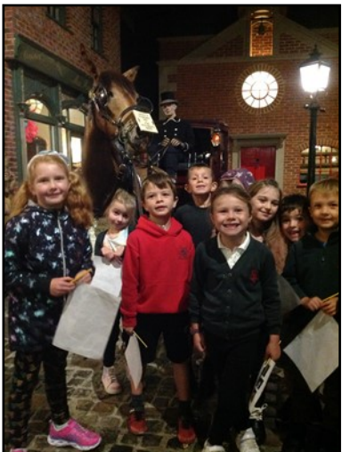
Well done Year 2!